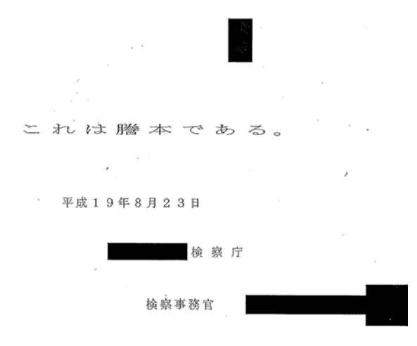
Fig. 3.1 (continued)

of secrecy serves the state's interest in seeing that executions are done as impersonally, bureaucratically, and non-controversially as possible. These are not democratic values. And sometimes officials claim the American way of execution—including the last-minute appeals and the "Forgive!" and "Kill him!" demonstrations that often occur outside prison walls—is unseemly and unattractive. It is, but claiming "the USA is worse" does not mean the Japanese way—"your time has come!"—is alright. Indeed, this Japanese justification reminds me of what my mother used to say ("don't change the subject!") when I excused my own bad behavior by suggesting that my brother had done something worse. It is, in a word, irrelevant.<sup>11</sup>