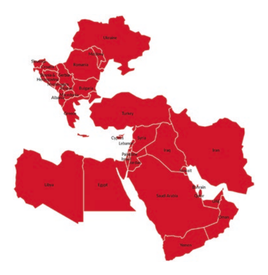
Fig. 2 Twenty-first century Balkans, Middle East and Ukraine